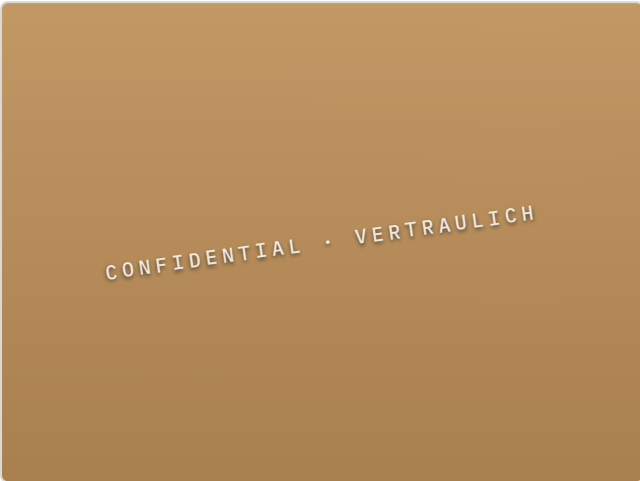
Fig. 1 – Carton storage before loading