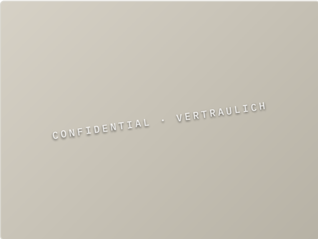
Fig. 3 – Inner packaging of goods