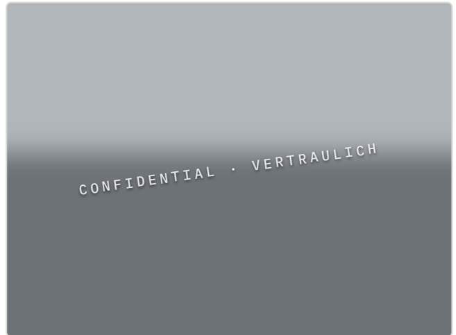
Fig. 6 – Loading into the container