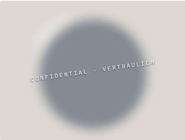
Fig. 5 – Spot check, opened carton