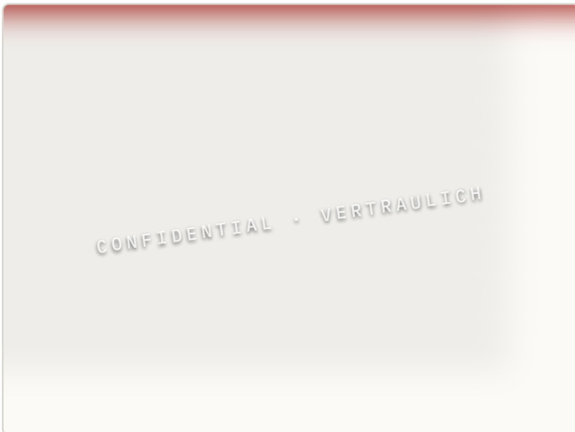
Business register extract (redacted)