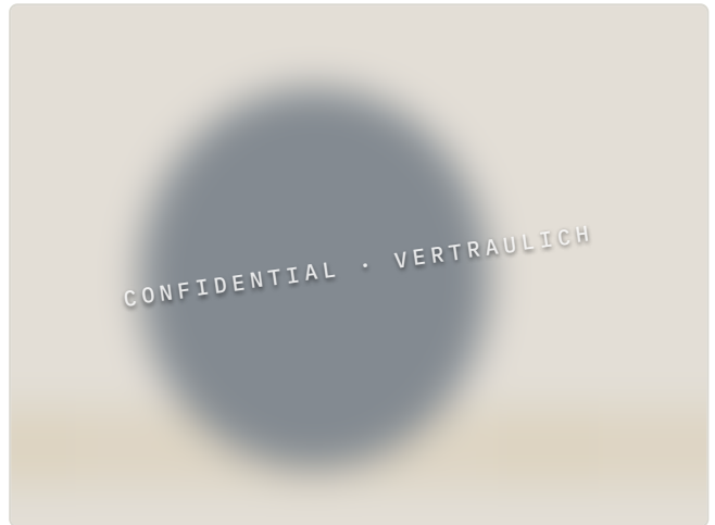
Fig. 4 – Dimensional check per checklist