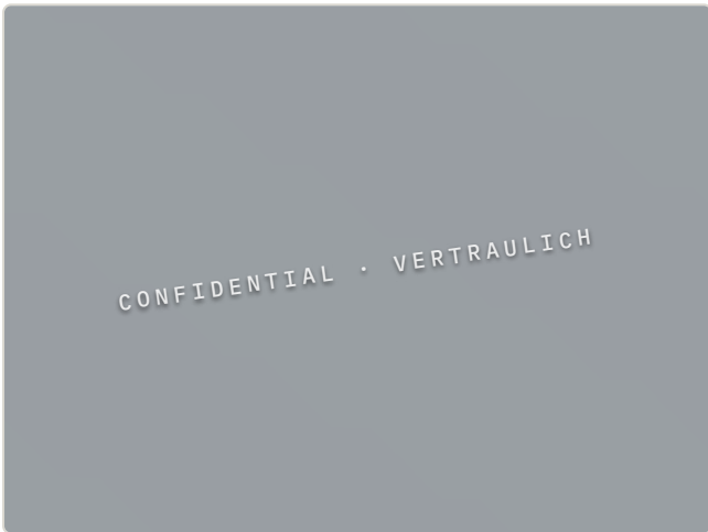
Fig. 3 – Detail of finish / seam