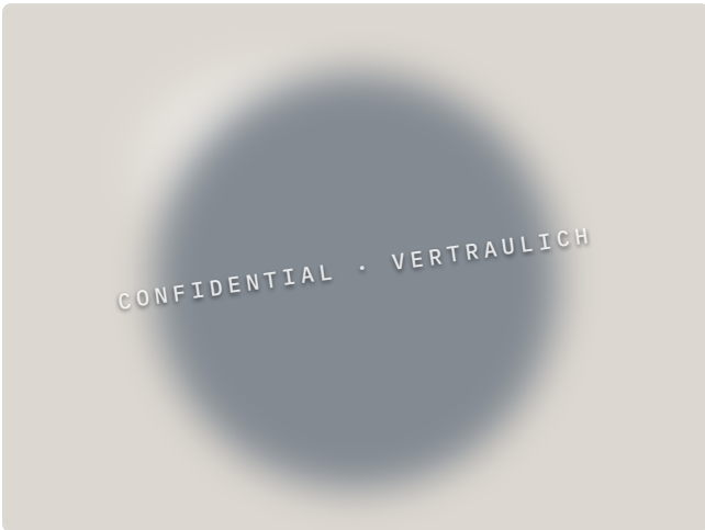
Fig. 1 – Sample, front