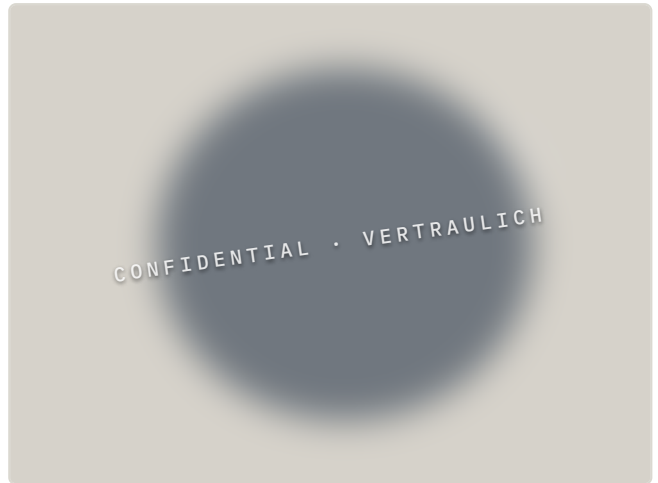
Fig. 2 – Sample, back