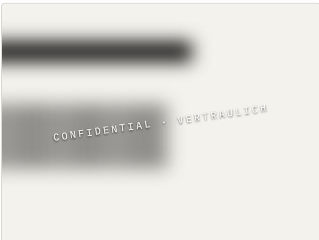
Fig. 5 – Label / print