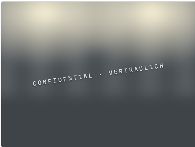
Fig. 3 – Production hall, line 2