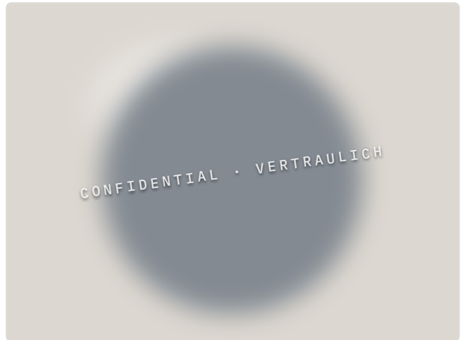
Fig. 4 – Product from ongoing production