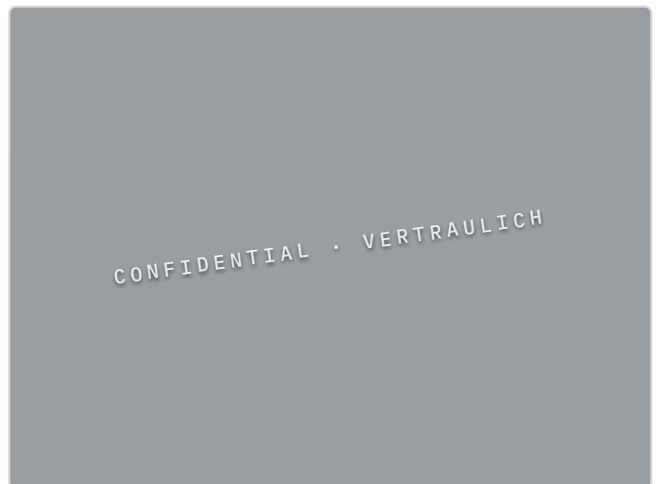
Fig. 6 – Final check at line end