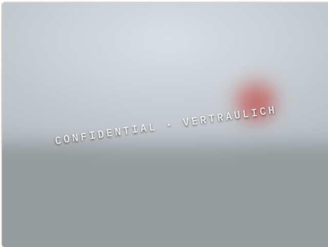
Fig. 1 – Façade & company sign