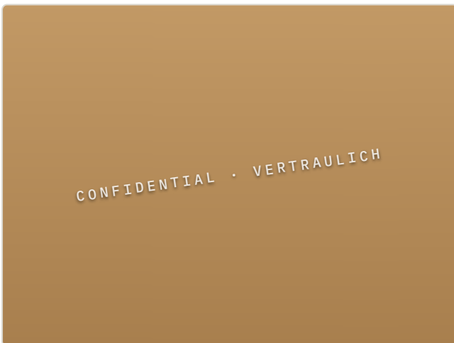
Fig. 5 – Packing & carton storage